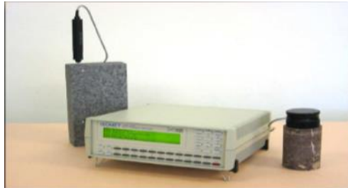
Figure 1: Conductivimètre

To measure the thermal conductivity of the mortars we used an "Isomet 2104" type apparatus (figure 1). It is a portable measuring instrument for direct measurement of the coefficient of thermal conductivity, specific volumetric capacity and temperature using the exchange of syringes and surface probes, according to ISO8302 [9].